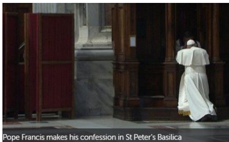
Pope Francis makes his confession in St Peter's Basilica

It is not the sacrament, scarcely frequented these days, that is changing. What the Pope proposes is a completely different outlook on Confession, different from the experience of so