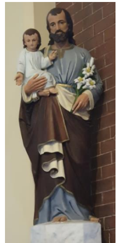
Statue of Saint Joseph with the child Jesus in our church

Oh St. Joseph, I never weary contemplating you and Jesus asleep in your arms. I dare not approach while he reposes near your heart. Press Him in my name and kiss his fine head for me, and ask him to return the kiss when I draw my dying breath. St. Joseph, patron of departing souls, pray for us. Amen